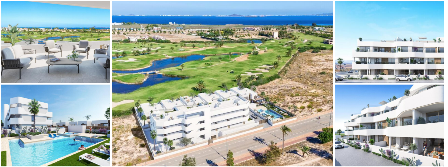
New Build Residential complex in Los Alcazares

Los Alcázares is an idyllic location for those looking to invest in a new residential property on the Costa Cálida. Just 25 minutes from Murcia Airport and approximately 55 minutes from Alicante Airport, this area is conveniently connected by highway to major cities like Cartagena, Murcia, and Alicante, as well as to other beautiful beaches along the Costa Cálida and Costa Blanca.