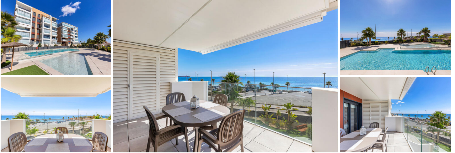
Sea front apartment in Mil Palmeras, Orihuela Costa

The property is distributed in a living room, two bedrooms, two bathrooms and a large terrace of 13m 2 . The residential has everything you need to incorporate you to live. Latest qualities in the facilities and 2 outdoor swimming pools (one of them for children). Subway parking and private storage room included in the price.