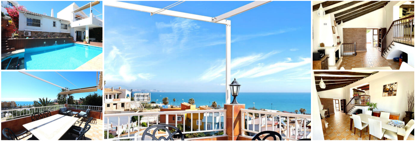
Charming Villa in Fuengirola, 400m from the Beach

This magnificent villa with stunning views is located on the border between Mijas and Fuengirola, just 400 meters from the sea. It offers panoramic sea views from its privileged position.