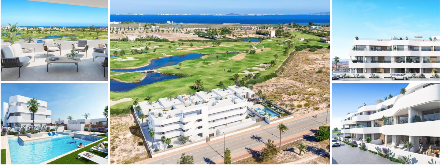
New Build Residential complex in Los Alcazares

Los Alcázares is an idyllic location for those looking to invest in a new residential property on the Costa Cálida Just 25 minutes from Murcia Airport and approximately 55 minutes from Alicante Airport, this area is conveniently connected by highway to major cities like Cartagena, Murcia, and Alicante, as well as to other beautiful beaches along the Costa Cálida and Costa Blanca