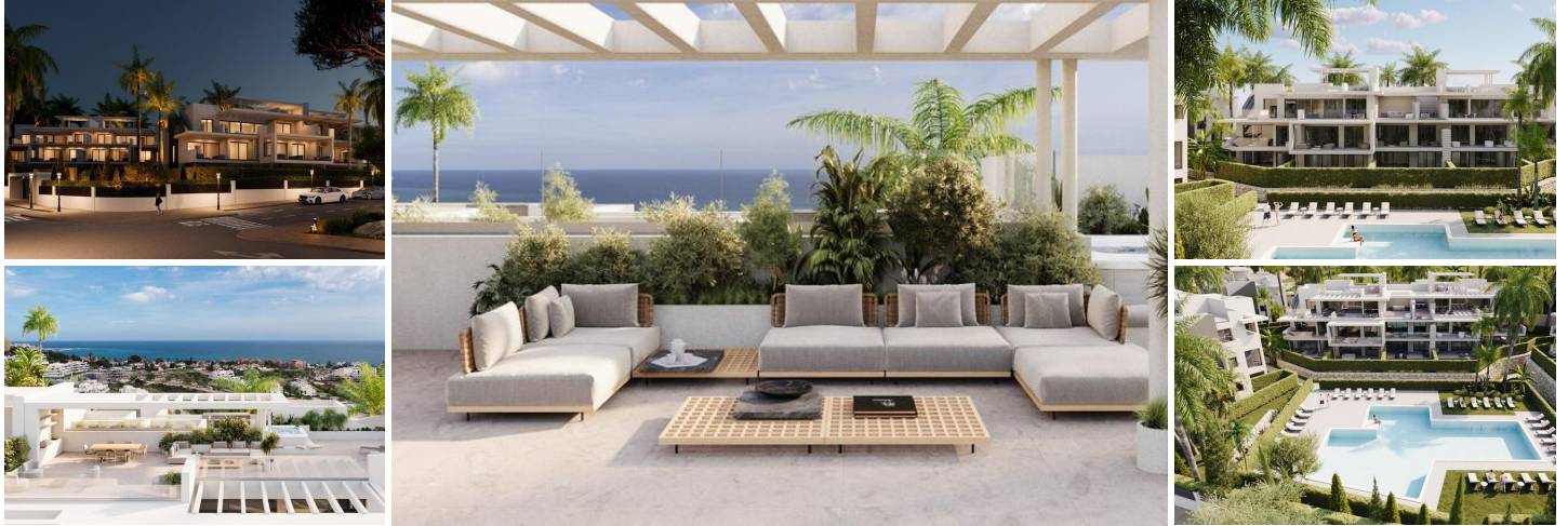
Modern Living in Estepona: Spacious Apartments with Sunny Terraces