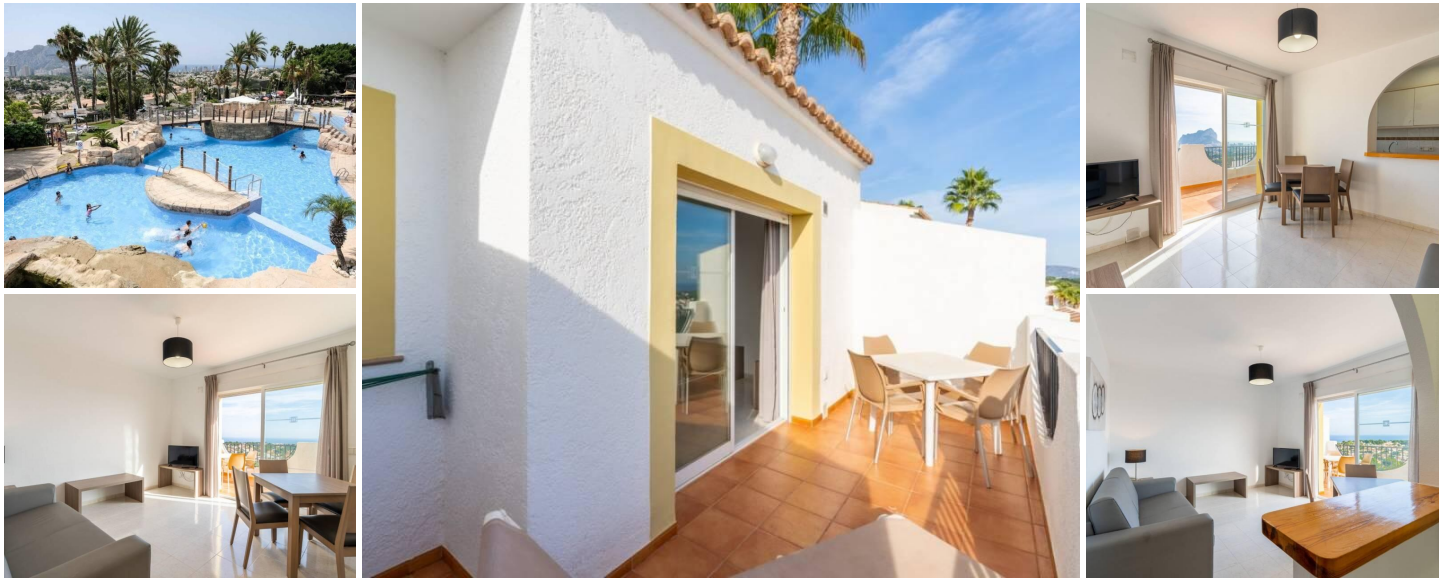
TOP FLOOR BUNGALOW APARTMENTS IN CALPE

Beautiful top floor bungalow apartments with 1 bedroom, 1 bathroom, open plan kitchen with the lounge area, fitted wardrobes and terraces.