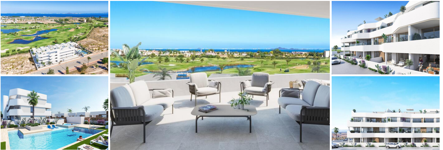
New Build Residential complex in Los Alcazares

Los Alcázares is an idyllic location for those looking to invest in a new residential property on the Costa Cálida. Just 25 minutes from Murcia Airport and approximately 55 minutes from Alicante Airport, this area is conveniently connected by highway to major cities like Cartagena, Murcia, and Alicante, as well as to other beautiful beaches along the Costa Cálida and Costa Blanca.