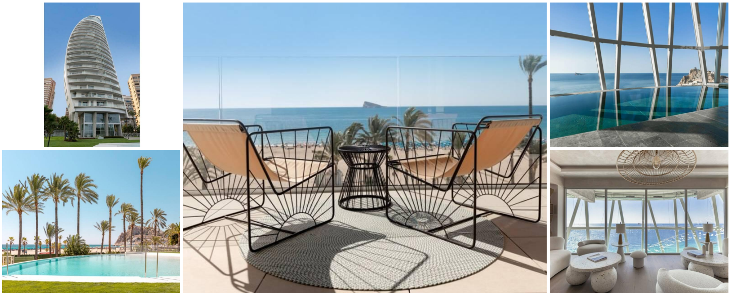
LUXURY SEAFRONT APARTMENTS IN BENIDORM

Unique New Build Luxury Key Ready residential on the Poniente beachfront, Benidorm.