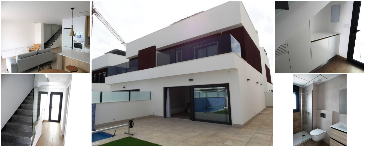
NEW BUILD SEMI-DETACHED VILLAS IN SANTIAGO DE LA RIBERA

New Build development of 11 townhouses and semi detached villas in Santiago de la Ribera, 100 metres from the beach!