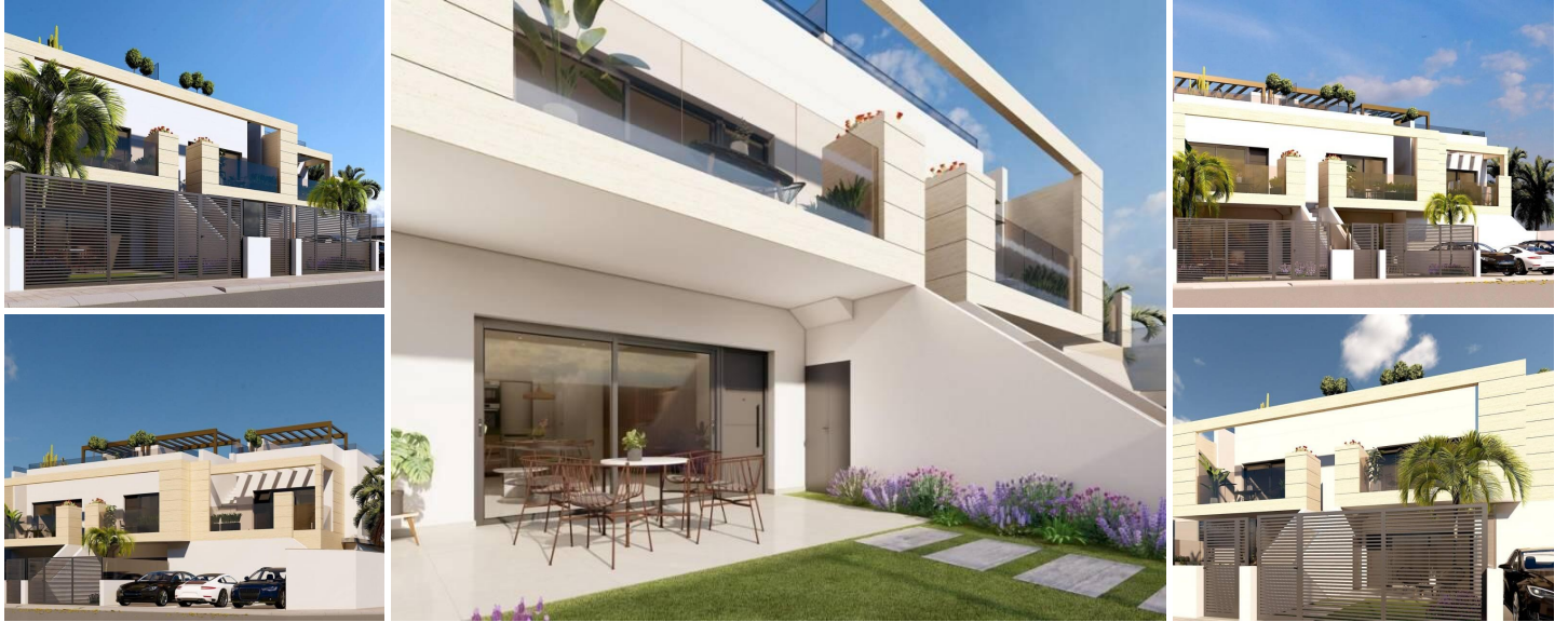
New Build Bungalows in Lo Pagán: Modern Living Near the Beach

Prime Location in Lo Pagán, San Pedro del Pinatar