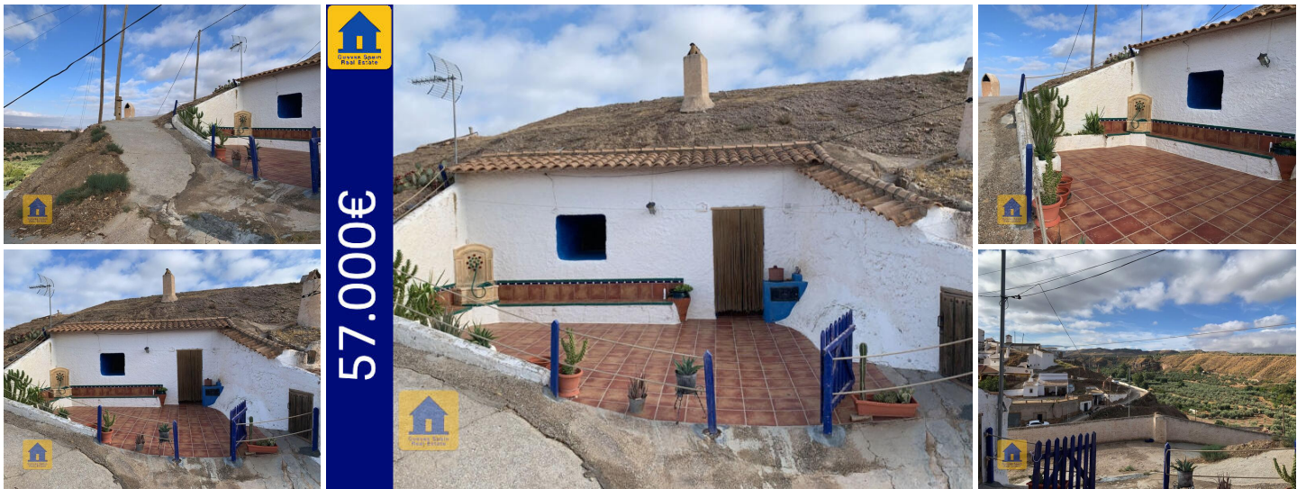
Cueva Sole in Freila

This is a quirky little cave house with nice views of the countryside. It is located on the edge of the village of Freila, not far from the stunning Lake Negratin, The property is a 5 minute walk to the village centre.