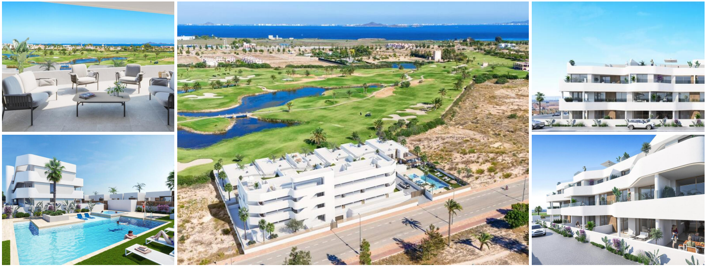
New Build Residential complex in Los Alcazares

Los Alcázares is an idyllic location for those looking to invest in a new residential property on the Costa Cálida. Just 25 minutes from Murcia Airport and approximately 55 minutes from Alicante Airport, this area is conveniently connected by highway to major cities like Cartagena, Murcia, and Alicante, as well as to other beautiful beaches along the Costa Cálida and Costa Blanca.