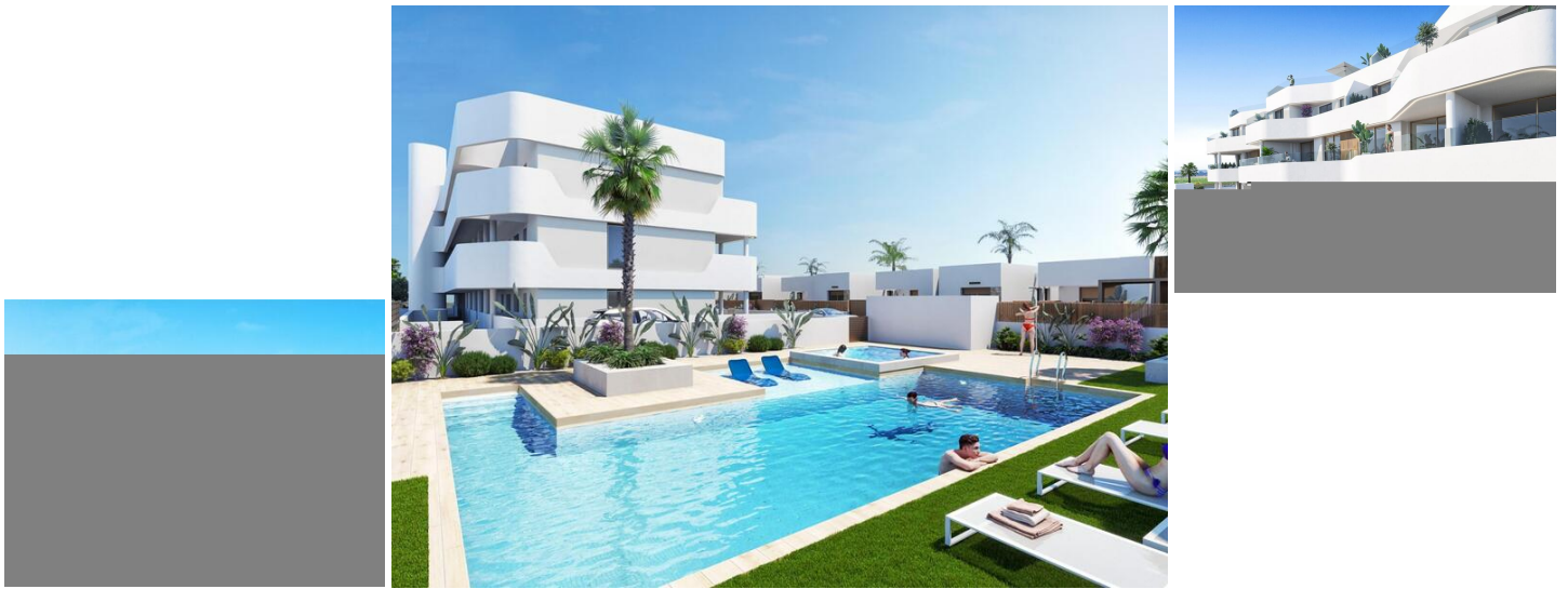
New Build Residential complex in Los Alcazares

Los Alcázares is an idyllic location for those looking to invest in a new residential property on the Costa Cálida. Just 25 minutes from Murcia Airport and approximately 55 minutes from Alicante Airport, this area is conveniently connected by highway to major cities like Cartagena, Murcia, and Alicante, as well as to other beautiful beaches along the Costa Cálida and Costa Blanca.