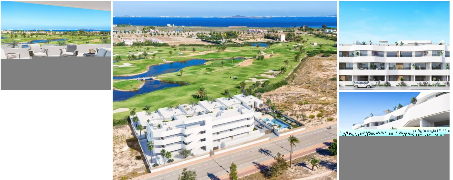
New Build Residential complex in Los Alcazares

Los Alcázares is an idyllic location for those looking to invest in a new residential property on the Costa Cálida. Just 25 minutes from Murcia Airport and approximately 55 minutes from Alicante Airport, this area is conveniently connected by highway to major cities like Cartagena, Murcia, and Alicante, as well as to other beautiful beaches along the Costa Cálida and Costa Blanca.