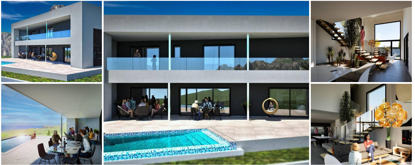
NEW BUILD VILLA IN LA NUCIA

Wonderful contemporary style villa with views to the sea and mountain in La Nucía, close to Panorama area and near the Elian's british school.