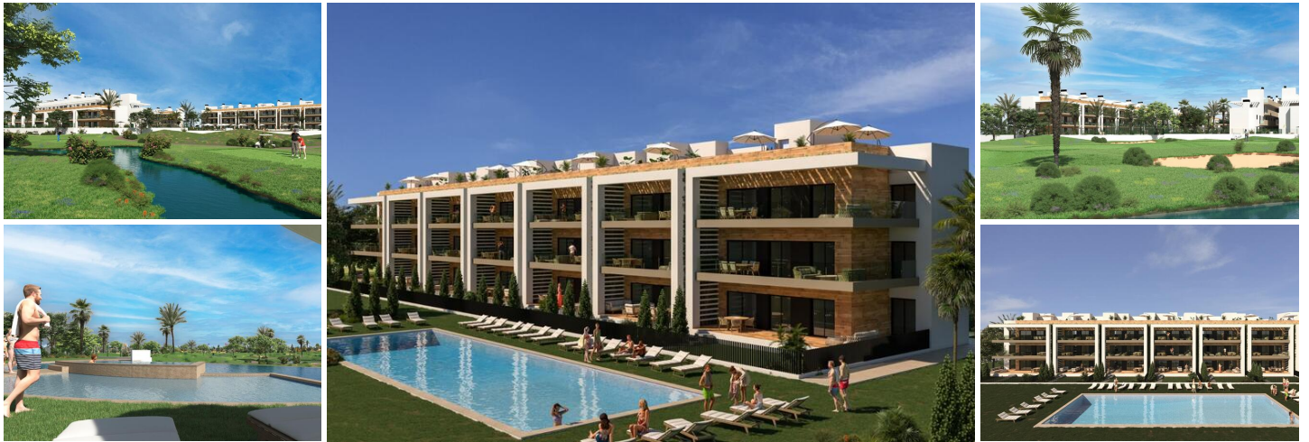
NEW BUILD RESIDENTIAL COMPLEX NEAR LA SERENA GOLF, LOS ALCAZARES

This amazing complex will be formed by 244 apartments with 2 and 3 bedrooms, divided in 8 blocks and 20 private Villas.