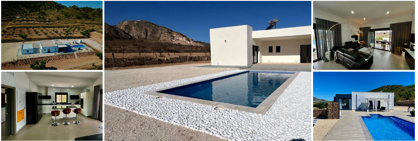
NEW BUILD VILLA IN ALBANILLA, MURCIA

New Build villa on a large plot in the municipality of Abanilla, province of Murcia.