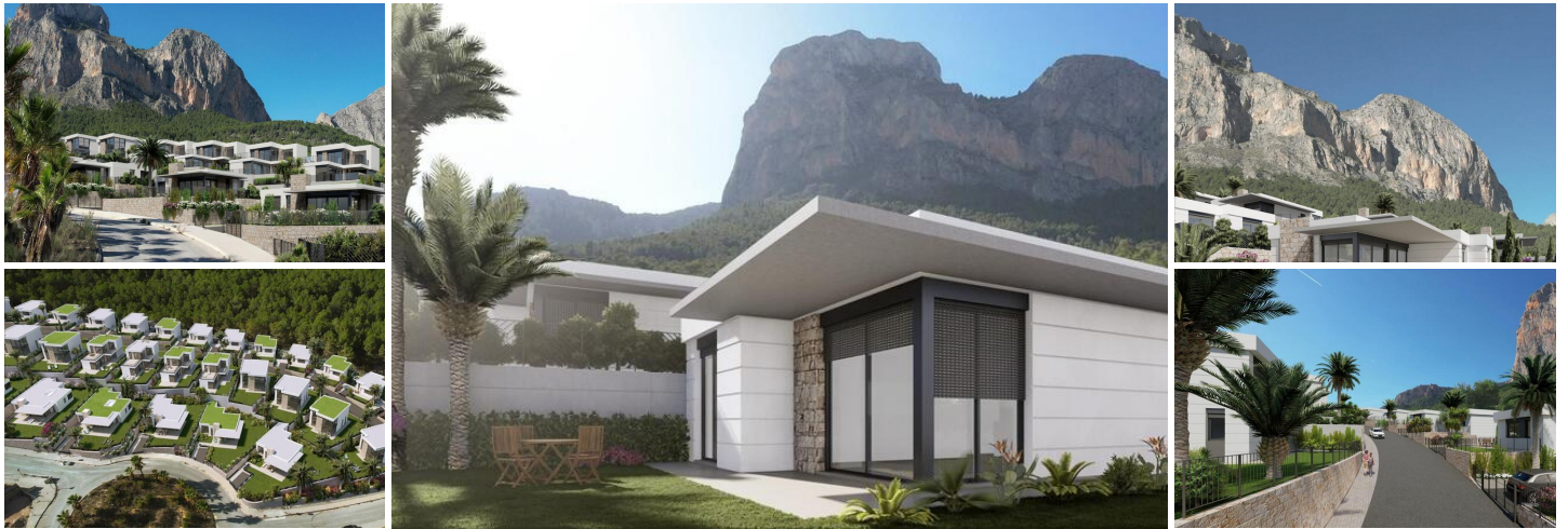
New Construction Villas in Polop, Alicante