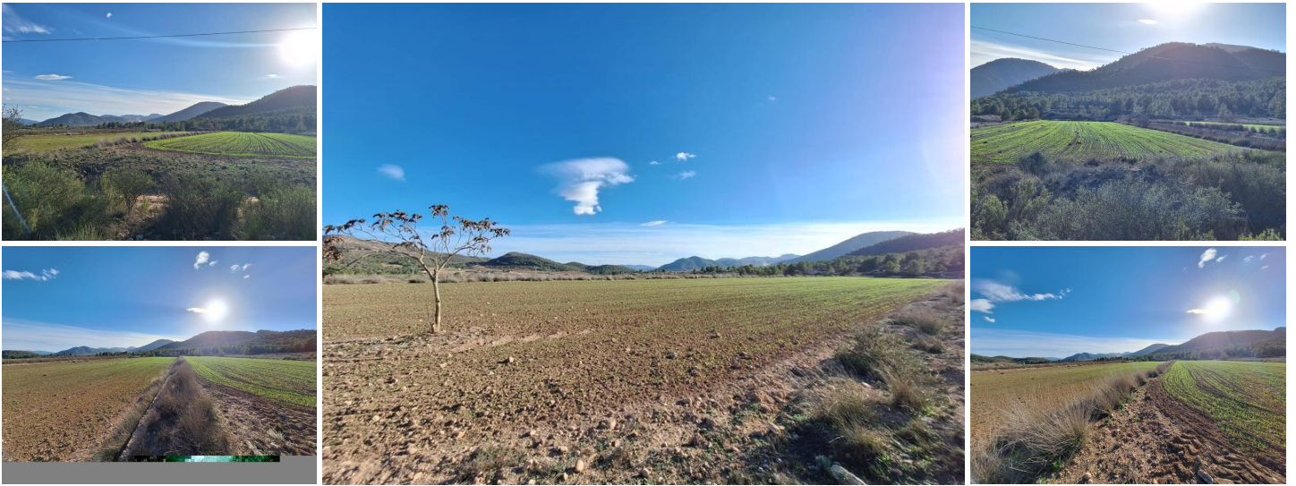
Plot with Stunning Views Located Between Pinoso and Monóvar

This beautiful building plot offers breathtaking views of the surrounding mountains, nestled amidst expansive vineyards and almond groves. The plot features two large terraces and its own natural area, perfect for relaxing walks right from your future new-build home.