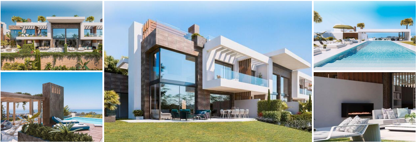
Luxurious New Build Townhouses in Río Real, Marbella