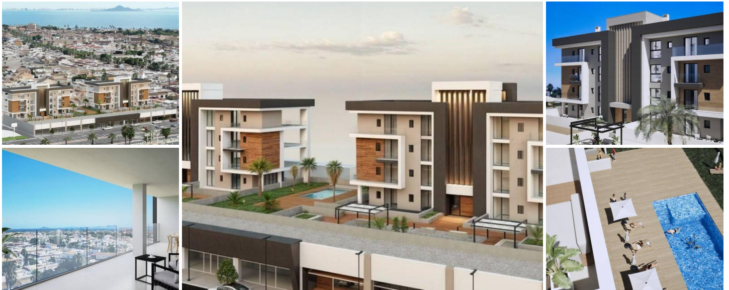
Tourist Apartments with Rental License in Los Narejos, Los Alcázares