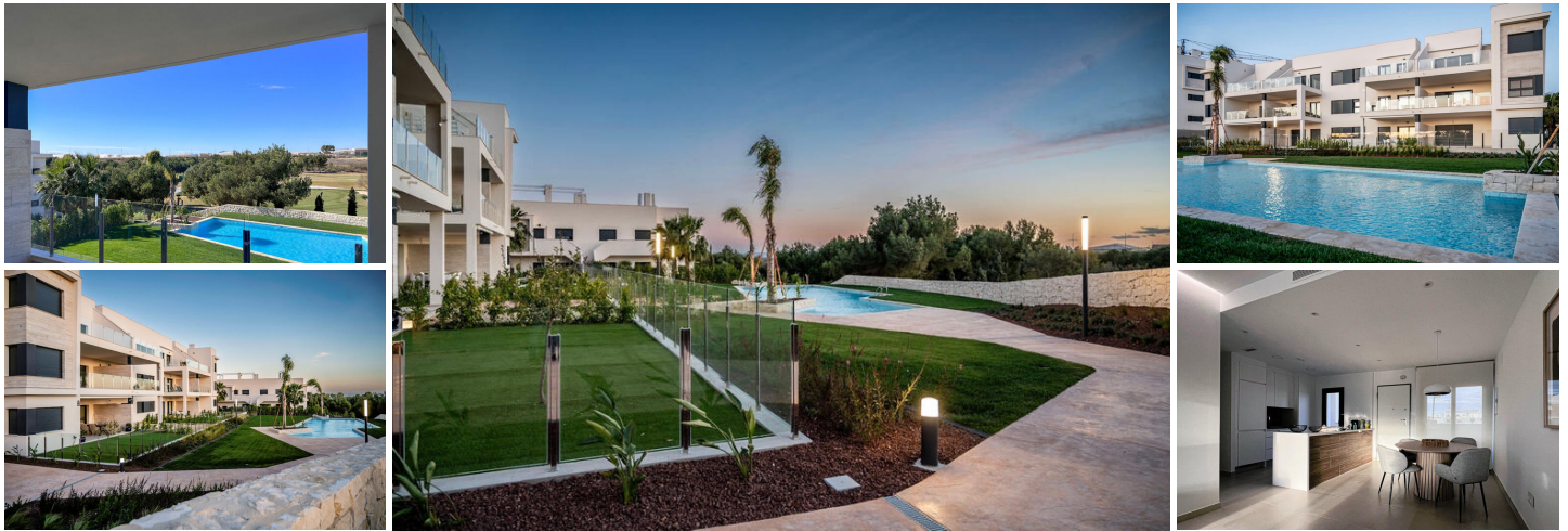
Modern Apartment in Pilar de la Horadada - Ideal Location and Comfort

This beautifully maintained 2-bedroom apartment in Pilar de la Horadada offers the perfect blend of comfort, convenience, and modern living. With a total constructed area of 74.70 m 2 , this first-floor flat is in excellent condition, ready for you to move in.