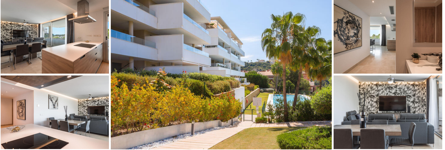
BENAHAVIS ... 3 Bedroom, 2 Bathroom apartment

FREE Notary fees exclusively when you purchase a new property with MarBanus Estates