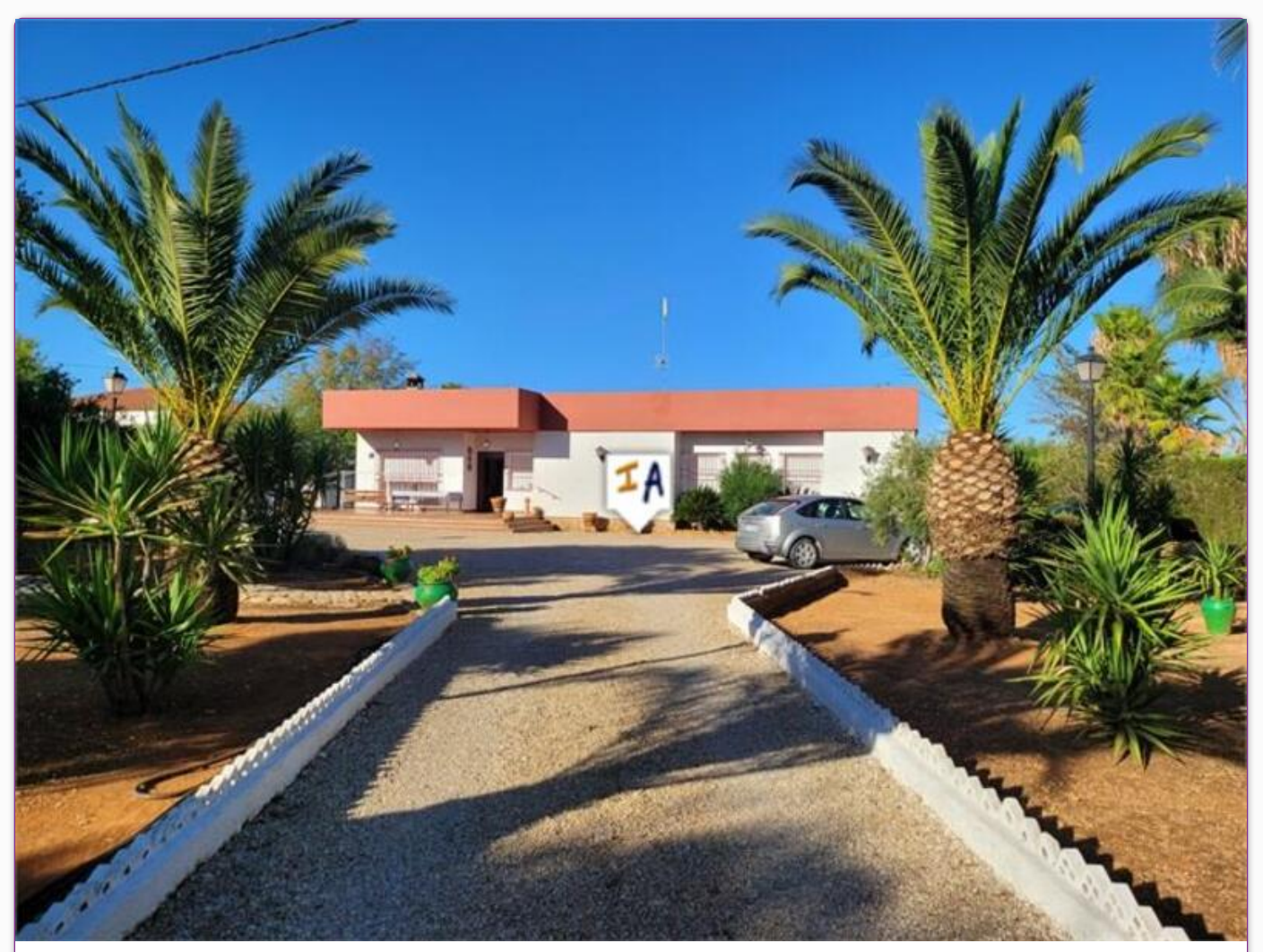
Villa i Puente Genil