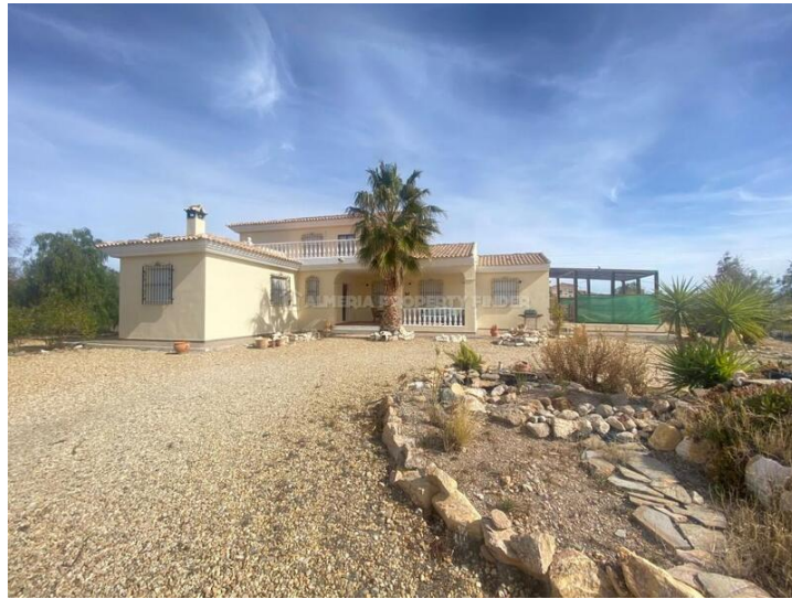
Villa Horti - A villa in the Albox area. (Resale)

This two-storey villa is located in Hortichuela, a few minutes' drive from Albox, where all amenities can be found: such as restaurants, bars, shops, banks, schools, medical center, etc. Around 40 minutes from the coast of Almería.