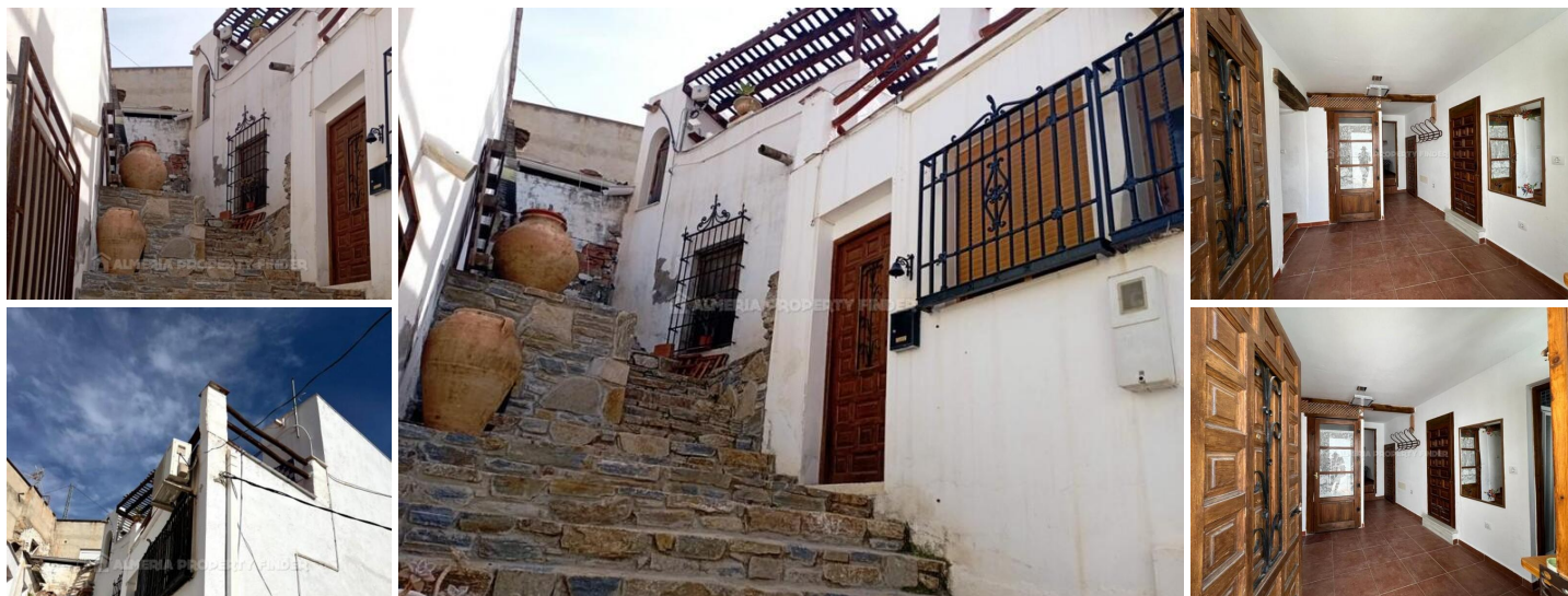
Casa Eva - A village house in the Sufli area. (Renovated)

Casa Eva, a beautiful, fully renovated character village house in the center of Sufli. This house is spread over 2 floors with 2 bedrooms, 2 bathrooms, fully equipped open kitchen, dining room/sitting area, storage room and spacious roof terrace.