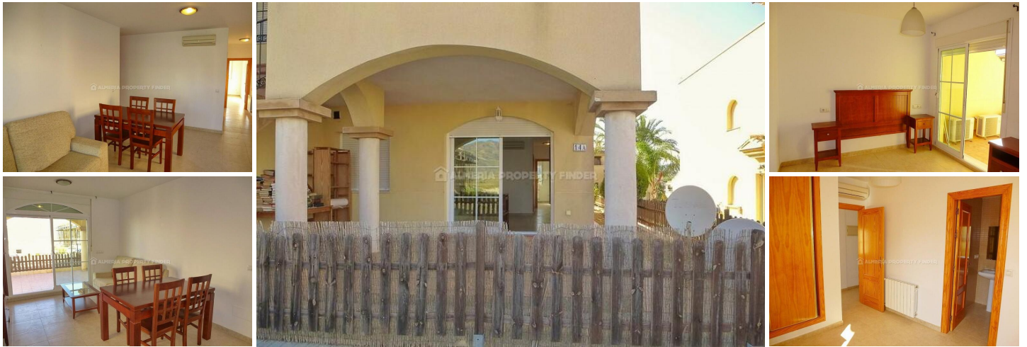
Apartamento Huerta - An apartment in the Los Gallardos area. (Resale)

A super 2 bedroom, 2 bathroom ground floor apartment with a living space of 110 m 2 situated just a few minutes drive from the village in the Urbanisation Los Olivos. The larger town of Los Gallardos is approximately a 4 minute drive, and a 10 minute drive to the commercial centre and beaches of Mojácar Playa.