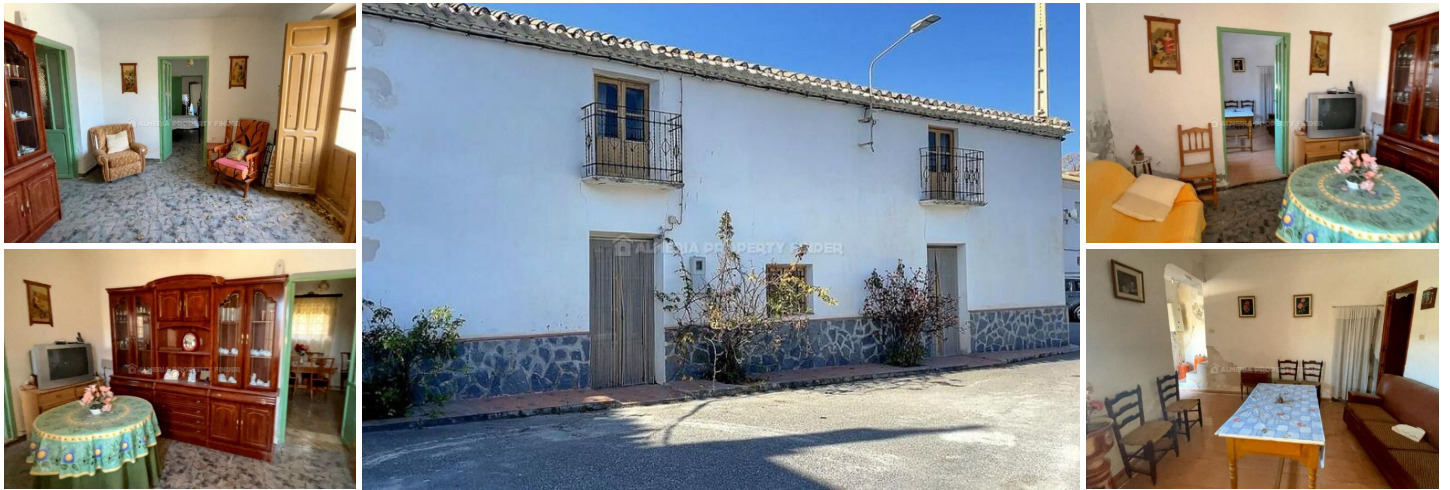
Casa Enebro - A country house in the Oria area. (For Renovation)

A large 360 m 2 , semi-detached, south facing two storey, 4 bed village house set in a small hamlet situated just 5 minutes from the town of Oria which offers all amenities for daily living. The larger town of Albox is approximately a 15 minute drive and also offers a wide range of amenities including shops, supermarkets, tapas bars, restaurants, schools and 24 hour medical centres.