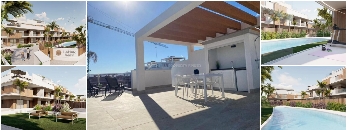
Lamar Resort VII P23-b2 - An apartment in the Pilar de la Horadada area. (Newly Built)

LAMAR Resort Luxury VII is a luxury project of 34 apartments with 2/3 bedrooms and 2 bathrooms divided into 3 blocks with communal swimming pool, jacuzzi, gym, playground and garage with storage room. The ground floor apartments have large gardens, the first floor has terraces and the penthouses have a solarium with jacuzzi. The facades of these buildings are clad with high-quality ceramic tiles combined with a white dirt-resistant monolayer.