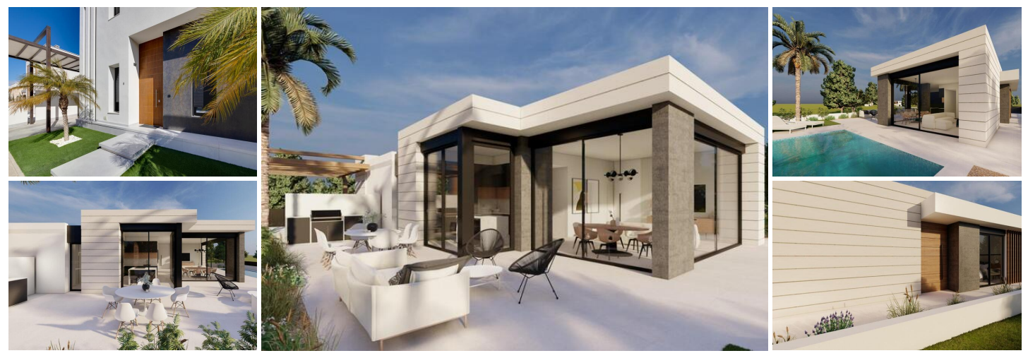
NEW BUILD VILLAS IN PILAR DE LA HORADADA ON THE GOLF COURSE

New Build residential of 6 detached villas in Pilar de la Horadada.