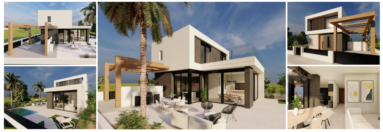
NEW BUILD VILLAS IN PILAR DE LA HORADADA ON THE GOLF COURSE

New Build residential of 6 detached villas in Pilar de la Horadada.