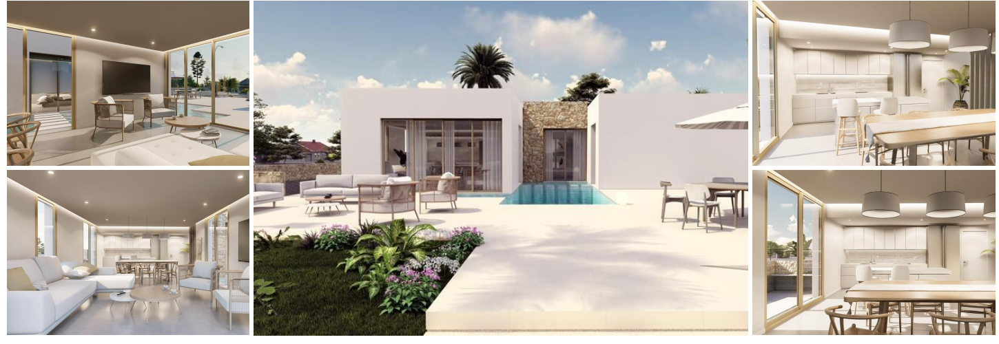
NEW BUILD VILLA IN LAS FILIPINAS

New Build Luxury villa in Las Filipinas, Villamartin.