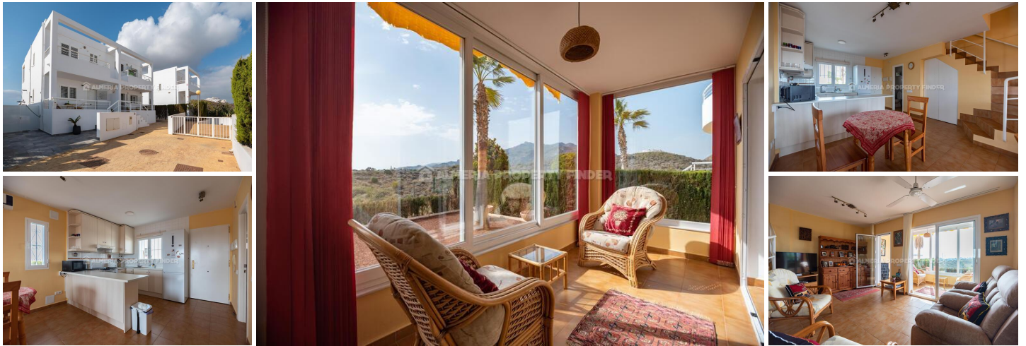
Casa Cordia - A town house in the Mojácar Playa area. (Resale)

Spacious semi-detached corner townhouse situated on a very nice residential complex in Mojácar. The property is just a short stroll to the beaches, bars, and restaurants and has lovely sea, mountain, and Mojácar pueblo views. Residencial INTI is a well-kept complex with a large communal pool surrounded by lush vegetation.