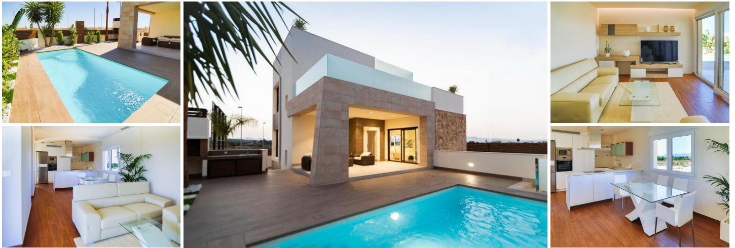
VILLA IN TYPICAL MEDITERRANEAN VILLAGE

Detached villa with 3 bedrooms, on one floor, and solarium.