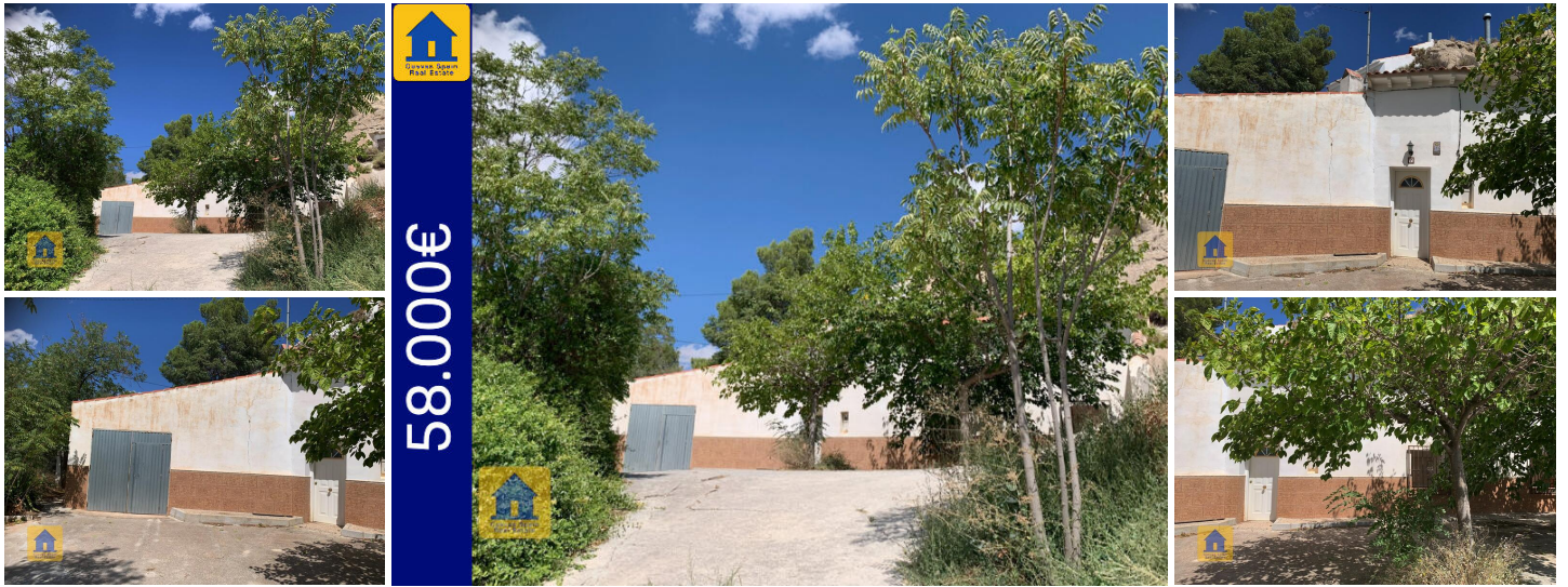
Cueva La Mora in Los Carriones.

This is a delightful cave property with a large patio and great views. The property is set back from the road, offering a cosy sense of privacy. There is a living room, dining room, kitchen, 3 bedrooms, two bathrooms, garage and a utility room. The patio has beautiful shade trees and space for parking. The property is located a 5 minute drive to the charming village of Castelléjar.