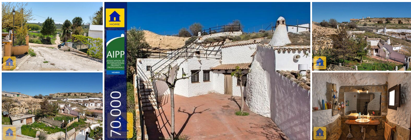
Huescar cave house juanfra

Beautiful authentic cave house in very good condition, fully furnished, ready to move in. There is a nice private patio and an upstairs terrace. Quiet location in a cul de sac. Next door is an open, grassy lot with trees, that can be negotiated into the purchase price, for a garden, garage and/or pool. Shops, restaurants and tapas within walking distance or 5 mins by car.