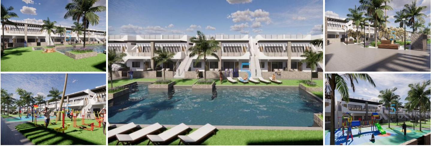
NEW BUILD RESIDENTIAL COMPLEX IN PUNTA PRIMA

New Built residential complex of bungalow apartments and 7 detached villas in Punta Prima.