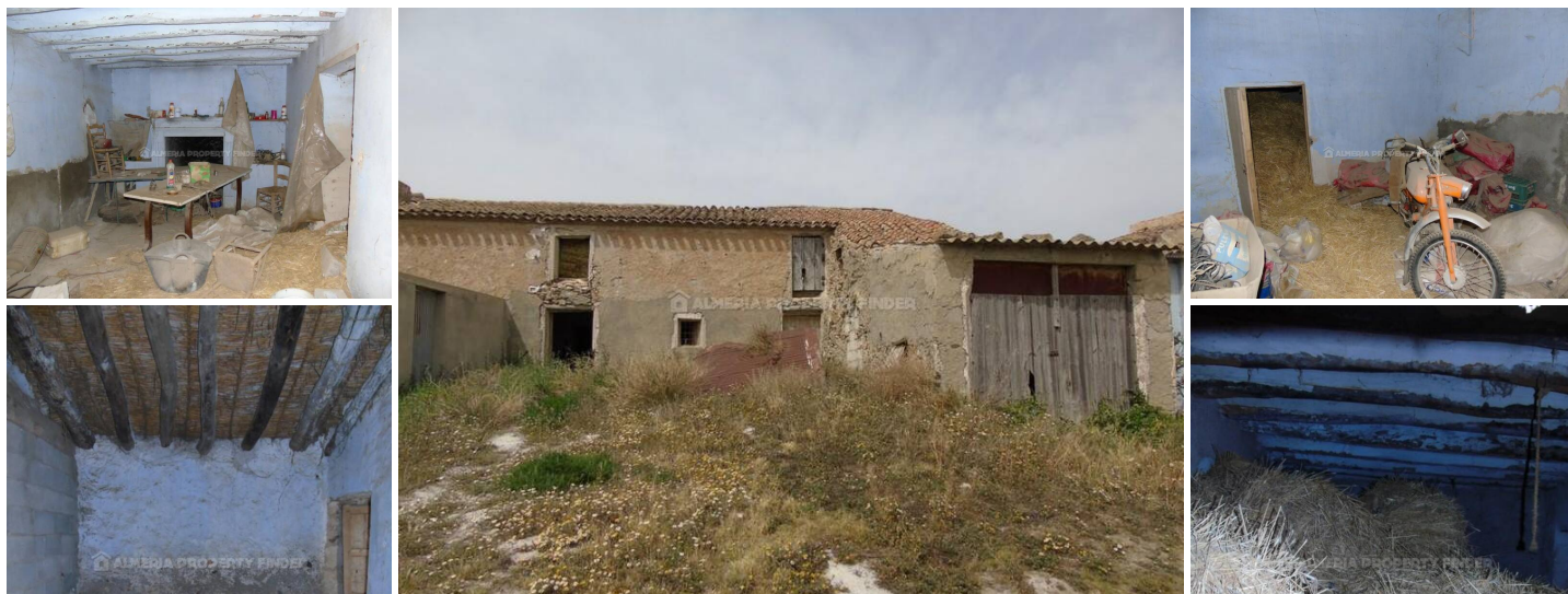
Cortijo Gloria - A village house in the Chirivel area. (For Renovation)

For complete renovation, this two storey village house has the potential to become a lovely 2/3 bedroom family home. The property is situated in a small rural hamlet around 7 minutes drive from the lovely town of Chirivel which offers all amenities for daily living.