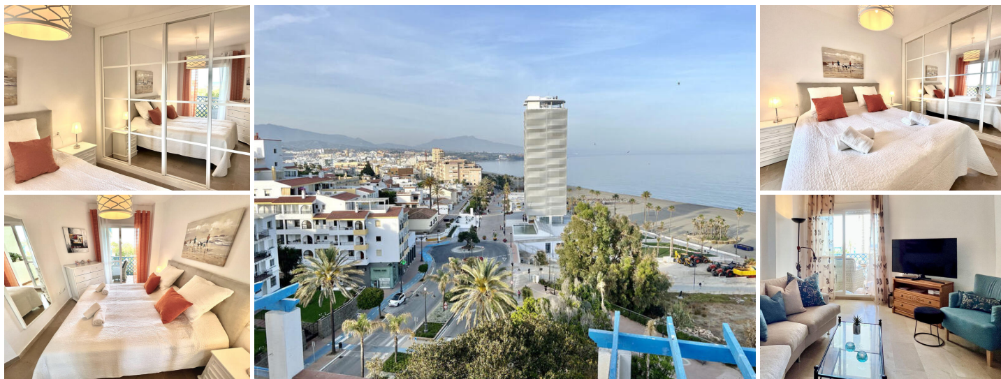
Sea View Apartment for Sale in Estepona Port – Fully Furnished, Prime Location, Excellent Investment

We're proud to present this beautifully located apartment for sale in Estepona, just steps away from the popular Estepona Marina and only a few minutes' walk from the vibrant town center, beaches, shops, and restaurants.