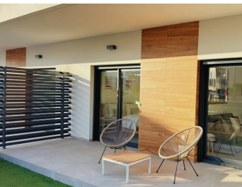
Modern Ground Floor Apartment for Sale - 300m from the Beach in Santiago de la Ribera

Discover this stylish ground-floor apartment, ideally situated just 300 metres from the beach in the sought-after coastal town of Santiago de la Ribera, Murcia Part of a modern three-storey development built in 2023, this beautifully designed home offers contemporary living in a prime location