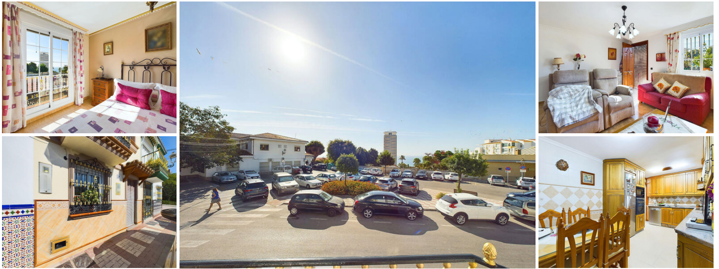
SECOND LINE BEACH 2 BED/2 BATH TOWNHOUSE – ESTEPONA PROMENADE!

Immaculately maintained and upgraded family townhouse less than 2 minutes walking distance from the emblematic Mirador de Estepona, the new promenade and the beach!