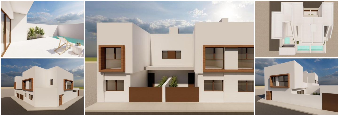
Newly Built Townhouses in San Javier - Modern Design and Privileged Location