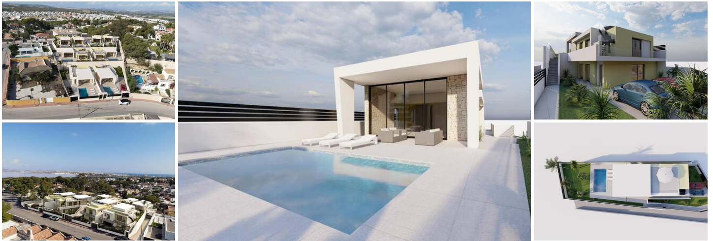
New-Build One-Story Villas with Private Pool in Torrevieja