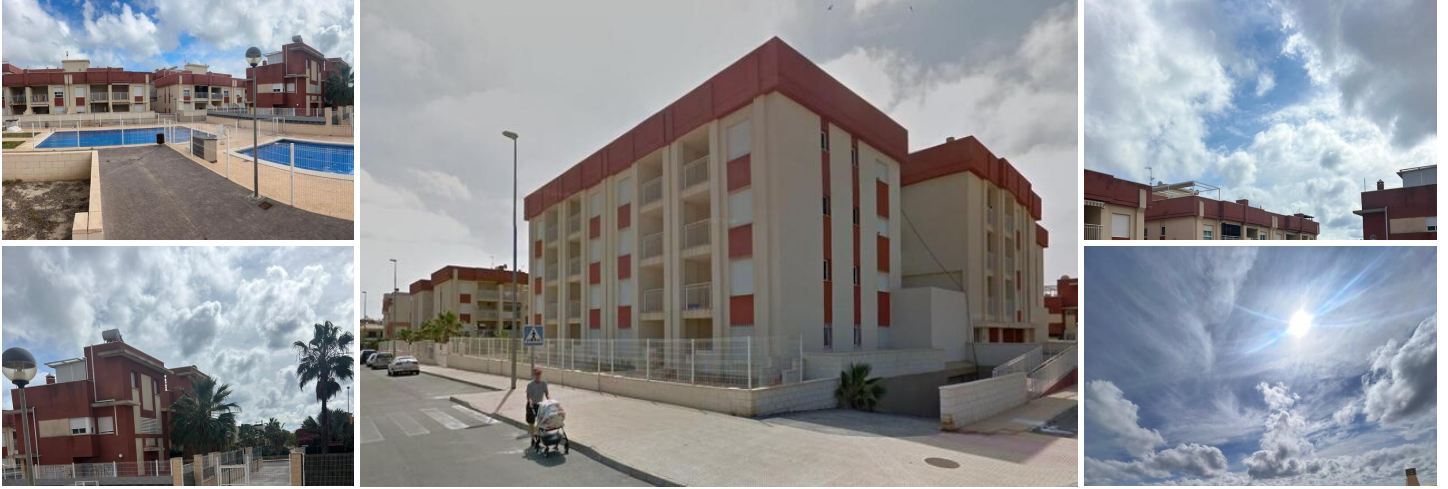
Regenerated Residential Complex in Lomas de Cabo Roig – Renovated Apartments