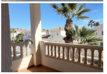
Stunning Corner Penthouse in Las Ramblas Golf - Your Dream Home Awaits!

Discover this immaculate top-floor apartment, perfectly situated in the prestigious Las Ramblas Golf community. Designed for those who value comfort, style, and convenience, this home offers everything you need for a relaxed and vibrant lifestyle. Step into a bright and spacious lounge/diner with a cozy fireplace, seamlessly connected to a modern, fully equipped open kitchen. The two sunlit double bedrooms feature fitted wardrobes, including a luxurious master suite with an en-suite shower room, French balcony, and a newly renovated stylish bathroom.