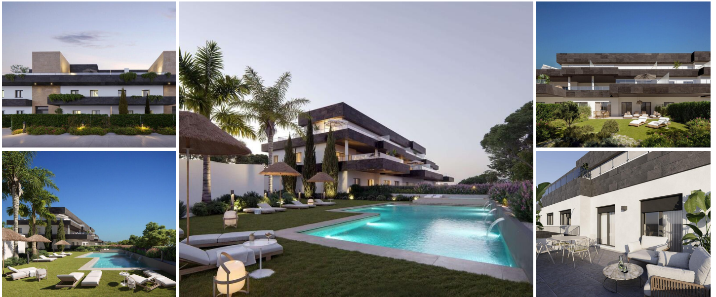
New Residential Complex Near Doña Julia Golf – Modern Homes with Spectacular Views