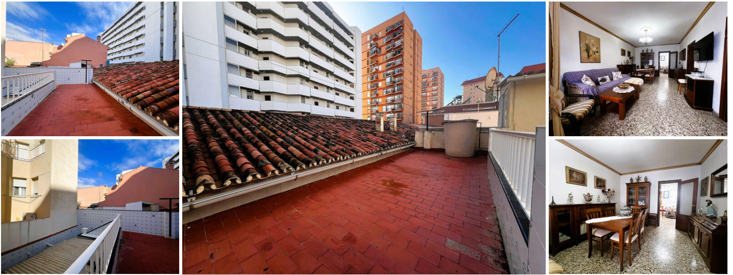
Central House for Sale in the Second Line of Fuengirola's Seafront Promenade

This property offers a total of 115 m 2 on one floor, with a solarium and storage room. The current layout includes a spacious living-dining room, 3 bedrooms, an independent kitchen, a large bathroom, storage room, patio, covered porch at the entrance, and a top terrace.