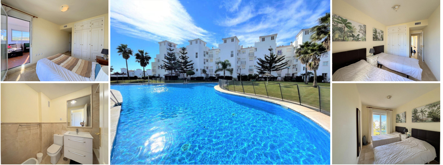
Stunning Apartment in La Duquesa

Discover this fantastic middle-floor apartment with a spacious terrace and private parking, ideally situated in Manilva Costa. Nestled within a well-maintained and tranquil urbanization, this home is just a 5-minute drive from the charming ports of La Duquesa and Sotogrande. These vibrant areas boast a scenic seaside promenade stretching along the Costa del Sol, offering an array of beach bars, fine dining restaurants, and leisure spots—perfect for year-round enjoyment.