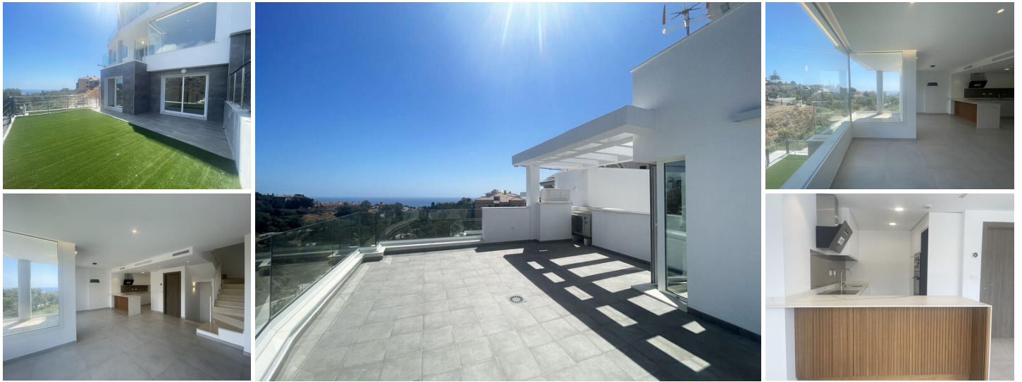
Townhouse AERA - Sea and mountain views in Torreblanca

Great opportunity, 10 minutes from the beach! In a complex of 4 properties, we offer this charming terraced house offering extraordinary views.