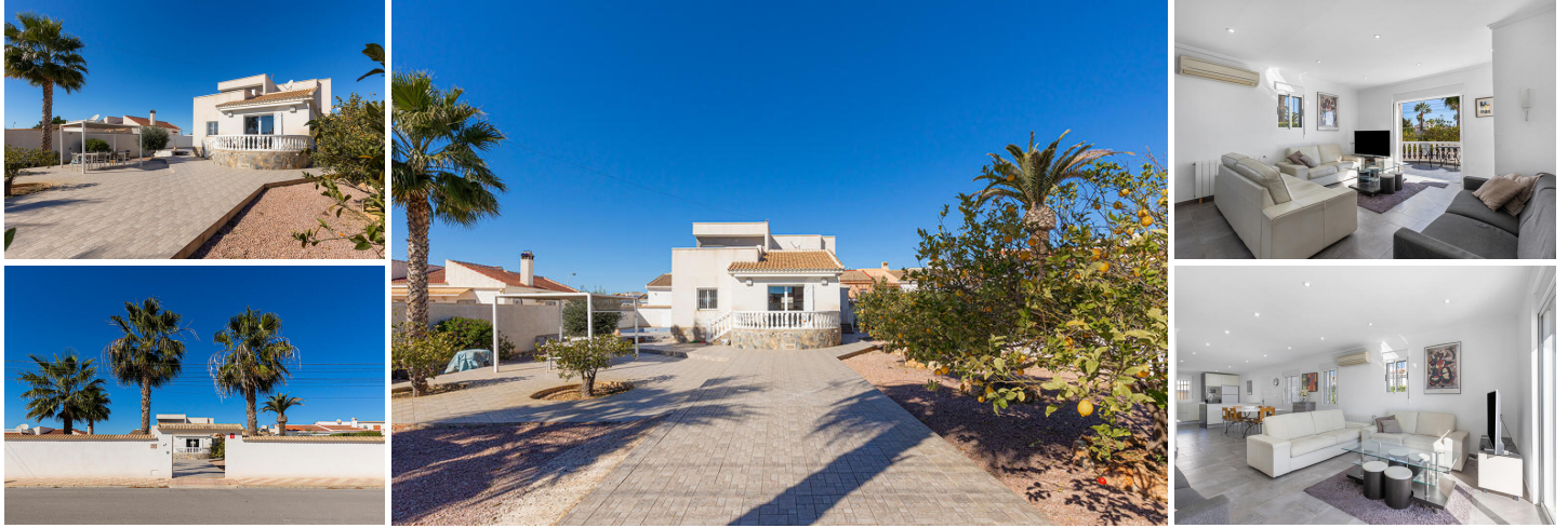
Renovated Villa with Large Plot in La Siesta, Torrevieja

Fully renovated detached villa featuring 4 bedrooms and 3 bathrooms, spanning 180m 2 on a generous 800m 2 plot.